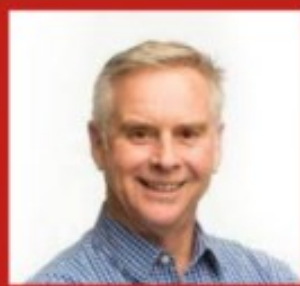
GLENN RIDGE MC